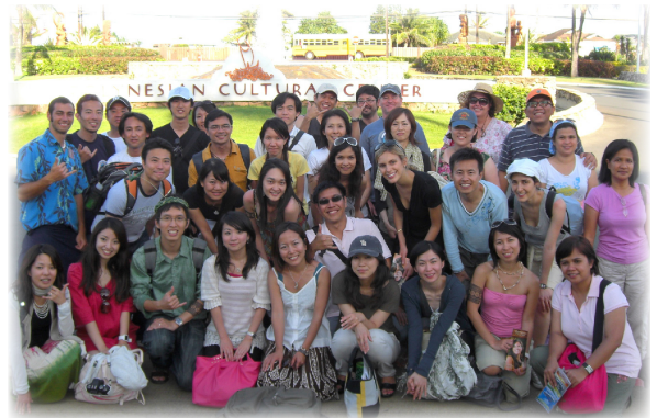
The EWKLP Spring 2009 students enjoy a day at the Polynesian Cultural Center

The EWKLP Spring 2009 class consisted of 33 students representing Thailand, Philippines, Korea, Japan, Malaysia, Australia, France, Indonesia, and China. Their backgrounds, cultures, and experiences contributed to interesting discussions when they compared their individual fieldnotes. The session reaffirmed the necessity for openness towards other cultures in order to understand others.